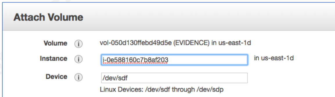
Figure 3 – Attach EVIDENCE volume to SIFT Workstation

Select the new volume in the AWS Console. Next, select the Attach Volume option from the Actions button. The wizard will ask which instance to attach to, so select the instance that was just launched. If the instance is not listed, the wizard may have created the EBS volume in the wrong availability zone. The console will report which device the volume will be attached to, /dev/xvdf , for example (Olsen, 2014).