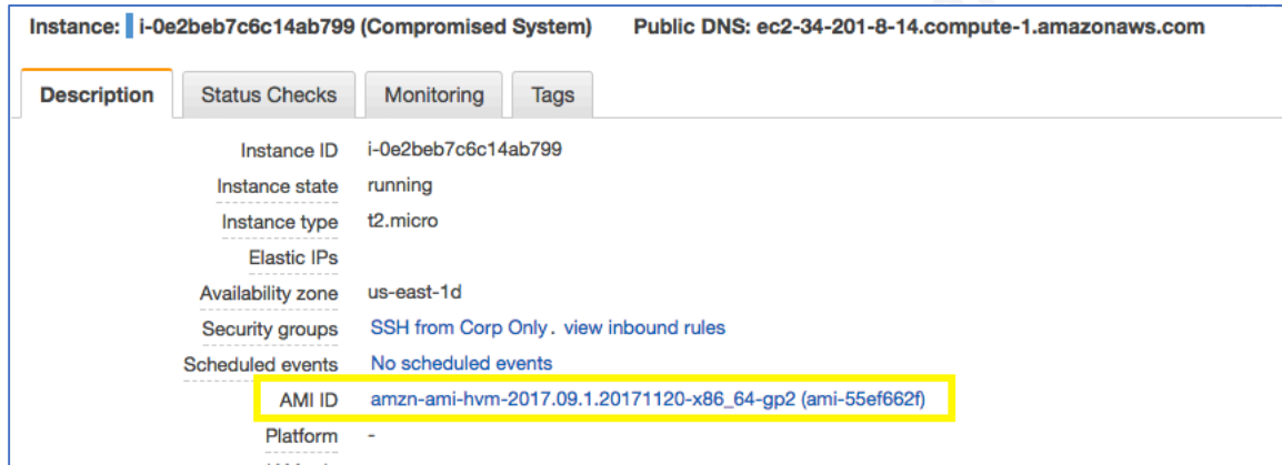
Figure 4 – Identifying the AMI to use for the Hash Database

The known files hash list will be generated on the SIFT Workstation from the same AMI that was used to launch the instance as determined by looking at the original metadata associated with the compromised instance. See Figure 4.