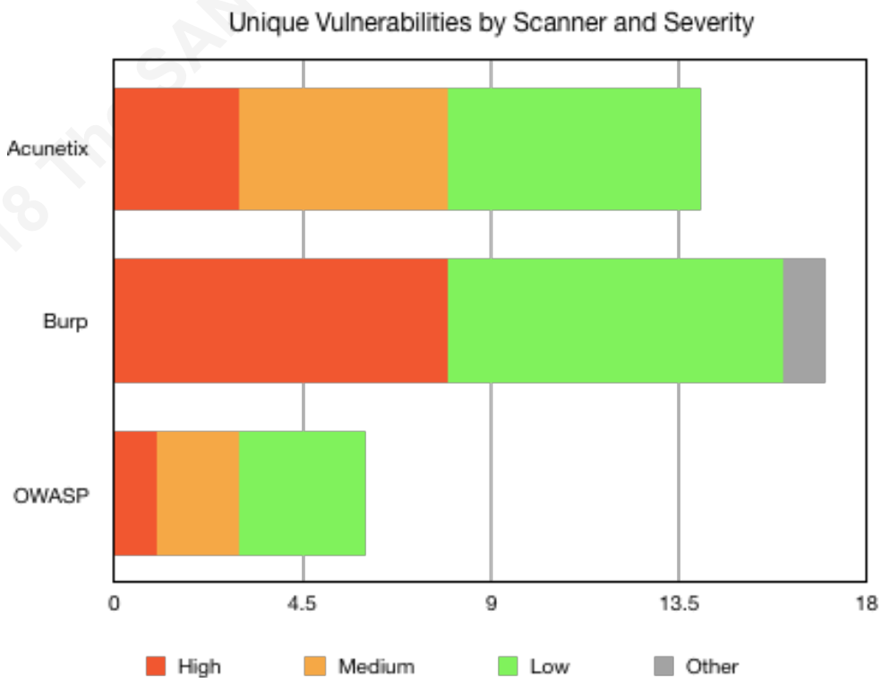
Figure 3: Unique vulnerabilities by scanner and severity