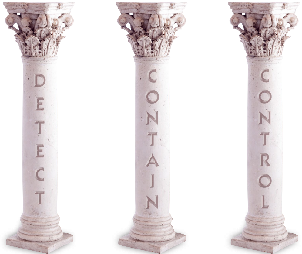
Figure 3. Pillars of Cybersecurity Success

Effective security solutions must align with how attackers work and focus on controlling the amount of damage an organization will experience. If compromise is inevitable, then the next best approach is to contain and control threats so damage is limited. One way to approach this problem is to think of three pillars, as we see in Figure 3.