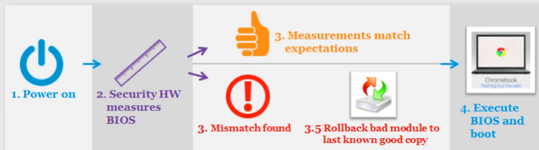
Figure 1. TPM Root of Trust Attestation on Chromebook Architecture

The Chromebook, a $250 consumer-grade netbook offered by Google and made by Samsung, among others, is one example of a consumer-oriented product that has a TPM built in. Google's process is illustrated in Figure 1.