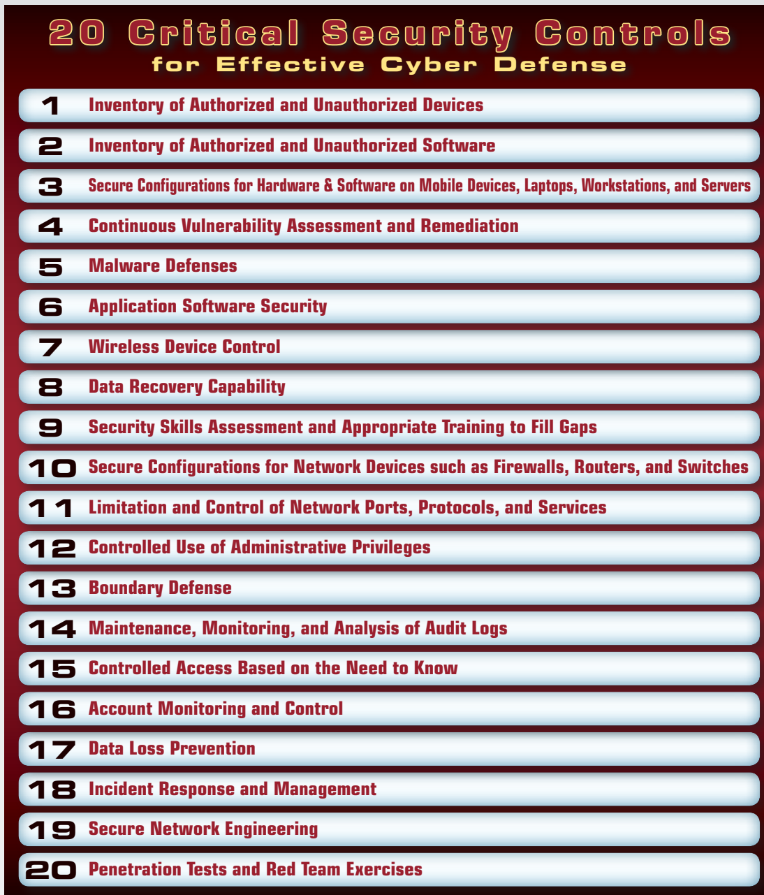
Figure 1. The Critical Security Controls

Today we have a whole ecosystem of layered security—endpoint protection, application protection, network protection and end-user controls—which must carry us through a variety of use cases. One set of guidelines coming into increasingly common use is the Critical Security Controls, listed in Figure 1.