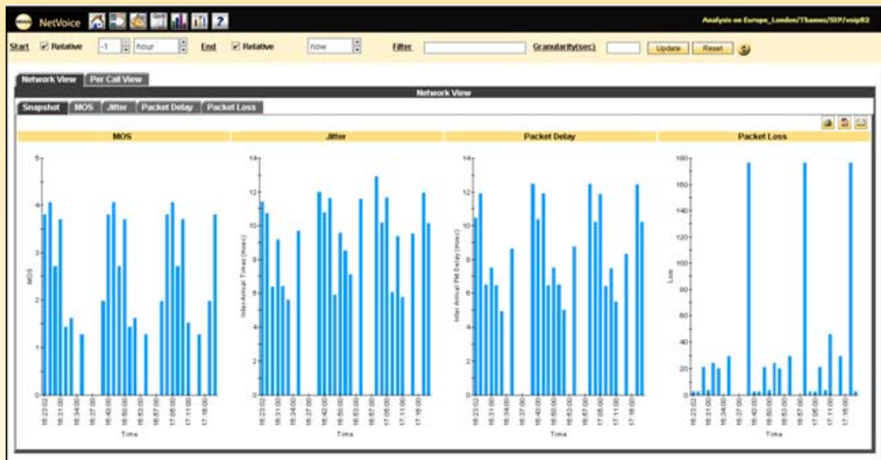
Figure 4: Hourly VoIP traffic load showing MOS, jitter, packet delay and packet loss