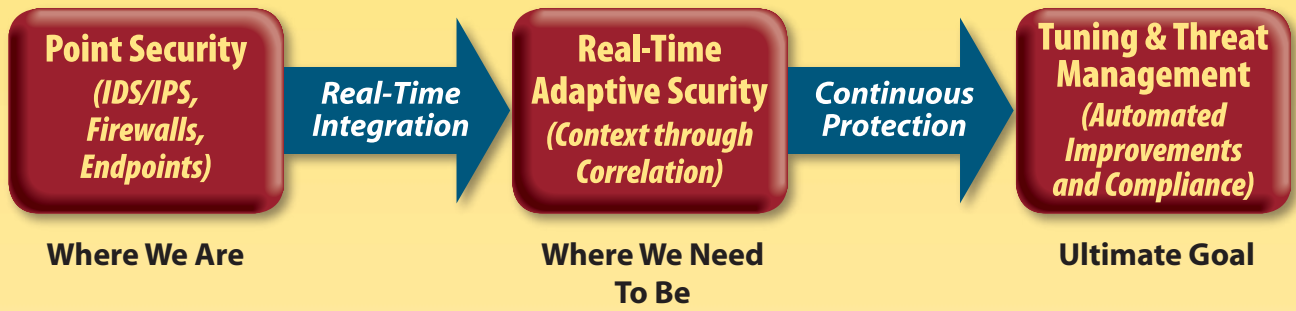
Figure 1: Moving to continuous compliance enforcement

Here's an example of how adaptive security works: A behavioral-based rule triggers IPS alerts for multiple malformed packets. Instead of sounding an alarm immediately, the intrusion analysis system checks the most recent scanning results on the server under attack. Those results show the system is missing several recent patches. Passive traffic analysis reports then reveals that the server has been attempting to communicate with unusual ports on local systems. With this additional information, it becomes clear that the organization has a zero-day attack occurring inside its network.