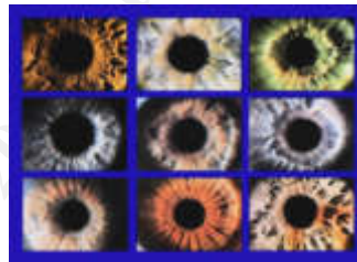
Figure 2: Visible representations of the Iris

Images of the iris adequate for personal identification with very high confidence can be acquired from distances of up to about 3 feet (1 meter). The striated anterior layer covering the trabecular meshwork creates the predominant texture seen with visible light, (Figure 2), but all of these sources of radial and angular variation taken together constitute a distinctive "fingerprint" that can be imaged from some distance.