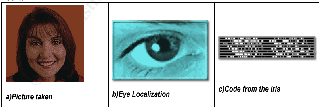
Figure 4: Functions of the EYE TM in Houston, TX

CitX Corporation, producing secure Internet e-Commerce and e-Business solutions, and its healthcare affiliated company IntraMedX Corporation created a strategic marketing relationship with IriScan, Inc. IntraMedX will utilize the iris recognition technology in conjunction with proprietary identity profiling technology and digital certificates to establish the validity of user identities, credentials and the accessibility to different classes of information. IntraMedX expects to establish its iris recognition-based digital certification system as the primary method of identity authentication and the secure access to private or confidential information in the healthcare sector. County and Montgomery County Prison institutions plan to enroll the irises of all inmates into their systems. The Putnam County facility estimates that about 1,000 inmates will be processed annually; Montgomery County estimates 7,000 annually. In addition, IriScan has announced that correctional facilities in Broward County, Florida; Lebanon, Ohio; and Lucasville, Ohio, are also adding the technology to their security protocol. The Sarasota County Sheriff's Office announced that in its first year using an access control iris identification system, it has successfully thwarted two inmate escape attempts at the Sarasota County Detention Center.