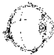
Figure 1: Iris

The human Iris is an internal organ of the eye, protected by the eyelid, cornea and the aqueous humour. It is part of the middle coat of the eye and lies in front of the lens. It is the only internal organ of the body that is normally visible externally. One of its distinctive characteristics is its stability. The iris features remain constant throughout the years. The iris is composed from several layers. Among the visible features of an iris throughout the layers are multiple collagenous fibres, contraction furrows, coronas, crypts colour, serpentine vasculature, freckles rifts and pits. It is seen in cross-section in the anatomical drawing of Figure 1.