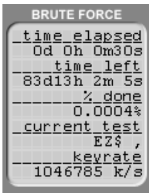
FIGURE 2. LC4 Time to complete crack estimate

The passwords and results from this simple experiment are provided in Table 2 on page 20 and in Figure 3 on page 21. Looking at the table shows that none of these are particularly easy to guess passwords, however short they may be. Several concepts were illustrated with this simple exercise. First, with a limited password space, most notably the 4 character, it is difficult to randomly generate a truly strong password. PCP is configurable such that only upper and lower case, numbers, and symbols are used in the created passwords, but even with multiple runs, it was still difficult to collect enough different characters to create 5 truly strong 4 character passwords. Also, this experience shows that the concept of password space is useful, and having a small password space truly reduces password strength. The passwords with small password spaces were cracked very quickly, and the passwords with larger password spaces took longer to crack, or were not cracked, even after 6 days of guessing attempts. Truly strong passwords do take significant time to crack, at least 6 days. But it is true that all the passwords, even 14 character ones, would have been cracked in less than 90 days. LC4 has the capability to distribute the brute force cracking task over many machines. The author was able to prepare the distributed crack for 100 different computers. The experiment