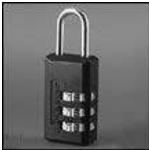
FIGURE 1. Master Lock brand Classic Black Luggage lock

For our example we will think of the combination for the lock as being a password. Each digit in the combination, or place in the password, can take values from 0 to 9, a total of 10 unique values, (0_1, 1_2, 2_3, 3_4, 4_5, 5_6, 6_7, 7_8, 8_9, 9_{10}) . The password for a 3 digit luggage lock would have 1,000 different combinations. So, a four digit lock allows 10,000 different passwords. Expressing this as an equation: