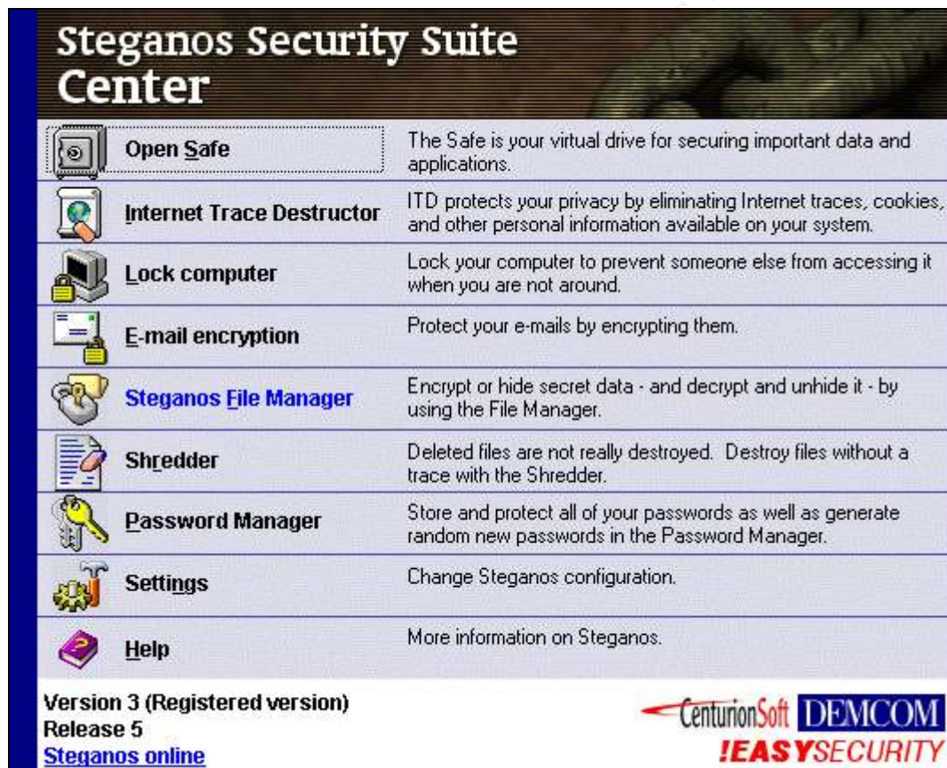
Figure 4 Steganos Security Suite

The simplicity of S-Tools4 easily demonstrated the power of embedding files within files while the Steganos Suite is a comprehensive desktop business crypto and stego tool intended for business use.