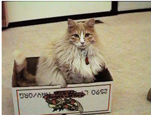
Figure 1 Picture of Family Cat Containing An Encoded Message

Today, it is not uncommon to use a combination of the two technologies with messages being both encrypted and inserted into an image.