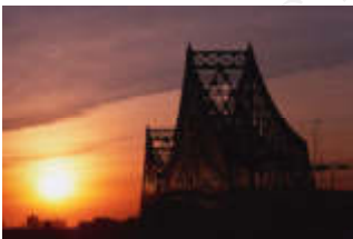
Figure 5 Picture with watermark

Distributor: Corbis, 15395 SE 30 th Place, Suite 300, Bellevue, WA 98007 USA Telephone (425) 649-4552, Fax (425) 957-9253.