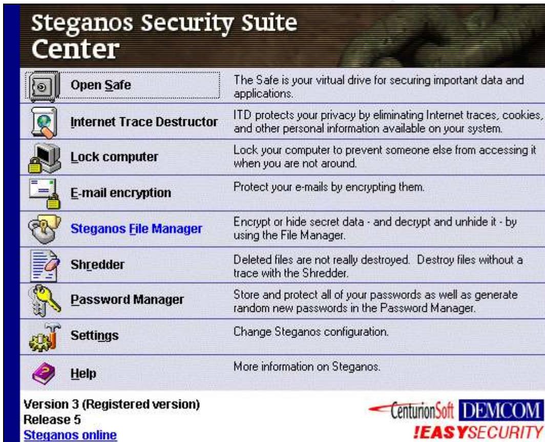
Figure 4 Steganos Security Suite

The simplicity of S-Tools4 easily demonstrated the power of embedding files within files while the Steganos Suite is a comprehensive desktop business crypto and stego tool intended for business use.