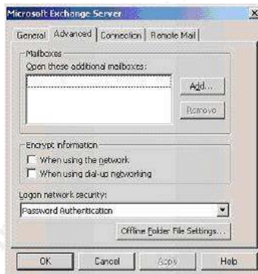
Figure 3 – View of Encryption information 22

This will ensure the protection of your communications between the server and Outlook.