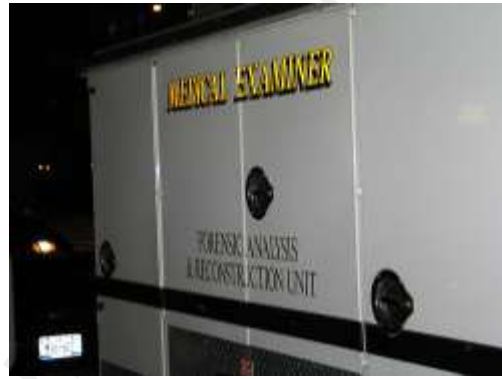
Foremost - jpg #24