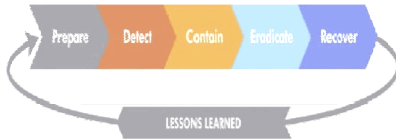
Figure 2 - Classic Incident Response Model (CNSS, 2007)

the IT security world, and its six core steps will likely be familiar to many readers. It is an evolution from simple incident response, which focused only on reactive steps while ignoring prevention and lessons learned. As a whole, the system describes a formal workflow through which an analyst moves while preparing for, reacting to and learning from security incidents. Throughout the process, there is a strong emphasis on documentation, as this enables the critical final step of putting the experience to work addressing the root cause of the issue. As with more typical IH situations when well considered but rapid action is key, this is particularly true in the case of mobile system incidents, where significantly more of the incidents will involve the physical loss of a device. Speed is critical in minimizing lasting damage to corporate data and reputation.