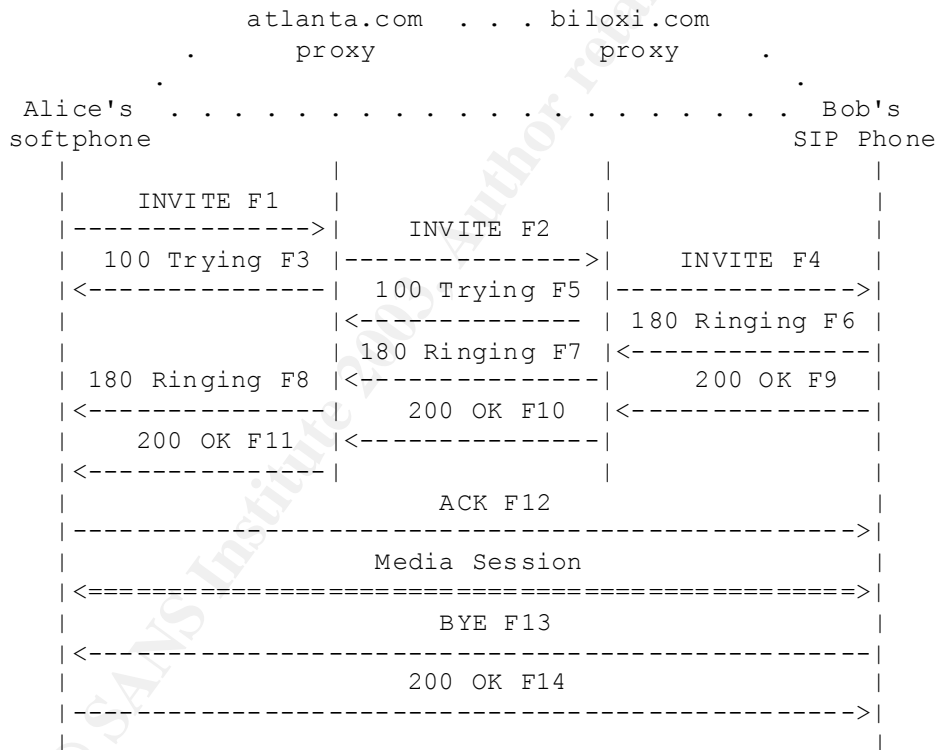
SIP session setup example with SIP trapezoid Source IETF RFC 3261 (1)

calls for a particular series of action and response in order to initiate a call. A user initiates a call; the device sends an INVITE request containing the users address and the invitees address in the form of a Uniform Resource Indicator (URI) such as sip:joesmith@sipuri.com, to a proxy server which receives the call. The proxy performs a type of DNS lookup to determine the address of the domain of the invitee and forwards the request to a proxy server in that domain usually the invitees' registrar server. The proxy modifies the request header to include a VIA field and sends a TRYING response back to the caller. The invitees' proxy server adds another VIA field to the request header, sends a TRYING response to the caller, and forwards the packet to the invitees' device. If the invitee responds to the invitation the device sends an OK response directly to the callers' device. Once the users device is contacted it responds by sending an acknowledge signal and looking up the originating User Agent (UA) via the proxy servers on the way. Once the call is established, the two devices communicate directly with one another and there is no need for the continued use of proxies. This is referred to as the "SIP Trapezoid" (1).