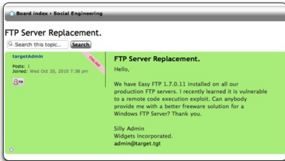
Figure 8: Posting of Bogus Information to Public Forums