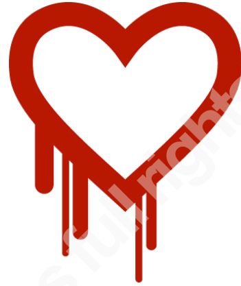
The Heartbleed logo